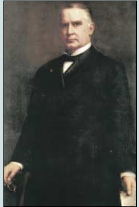
William McKinley, 25th President of the United States

A piece of American history will be brought to life by Ohio Masons and William McKinley Lodge, #431, during a reenactment of President William McKinley's Masonic funeral on Saturday, September 15, 2001.